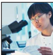
Train people as backup for technology.

FEMA's Capability Assurance effort focuses on resources and programs to help the state, tribal, and local emergency management and response communities be better prepared to respond to disasters and incidents of all kinds. These processes and resources focus primarily on assessment and exercise-related programs, processes, and systems.